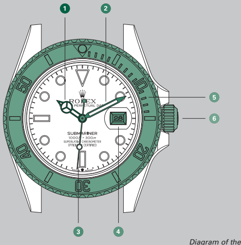
Diagram of the Oyster Perpetual Submariner Date